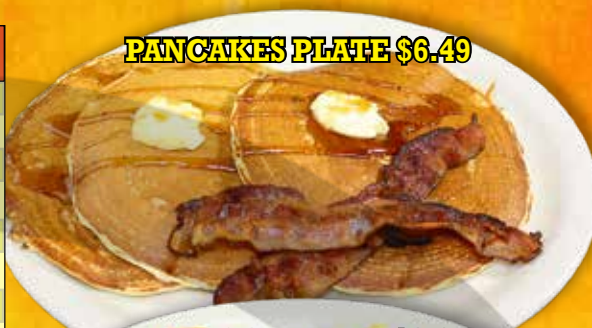
PANCAKES PLATE $6.49