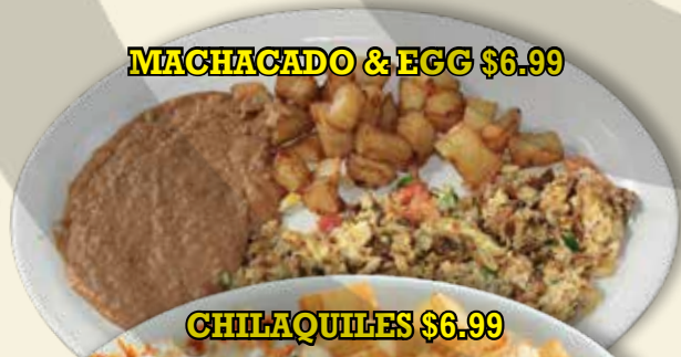
MACHACADO & EGG $6.99