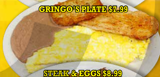
GRINGO'S PLATE $7.99