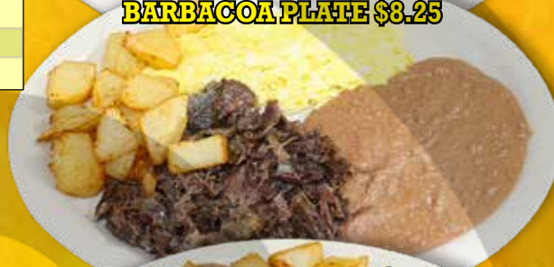
BARBACOA PLATE $8.25