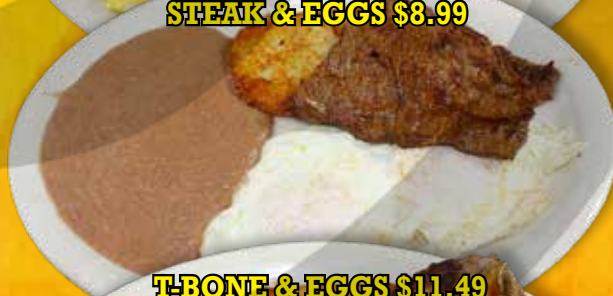
STEAK & EGGS $8.99