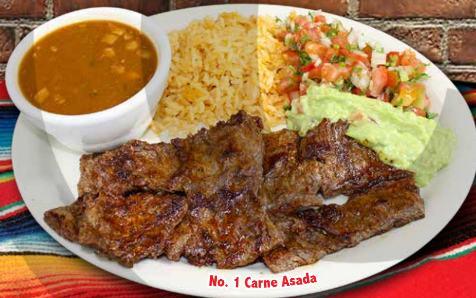
No. 1 Carne Asada