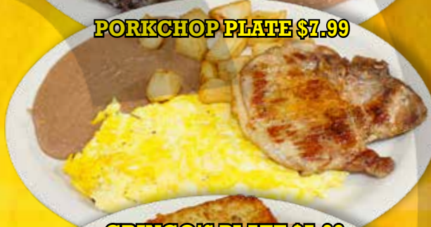
PORKCHOP PLATE $7.99