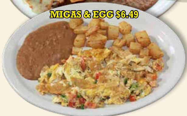
MIGAS & EGG $6.49

CAUTION! Chicken may contain small bones • Cuidado! El pollo puede tener pequeños huesos