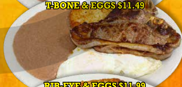
T-BONE & EGGS $11.49