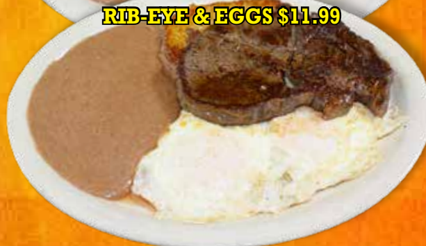
RIB-EYE & EGGS $11.99